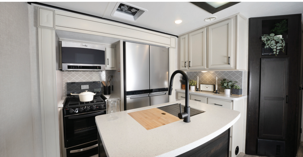
2023 Open Range Travel Trailer 338BHS