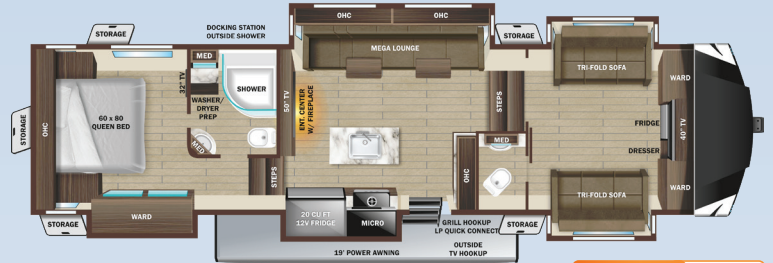
376FBH OPTION A