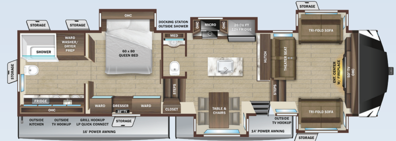
373RBS OPTION C