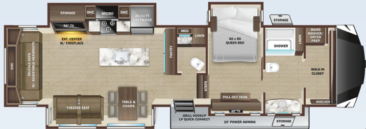
379FBS OPTIONS B & C