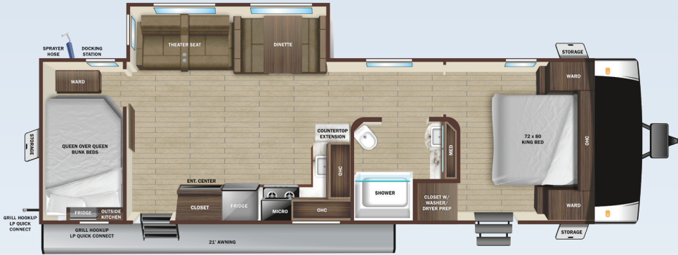
296BHS OPTIONS B, C, & D