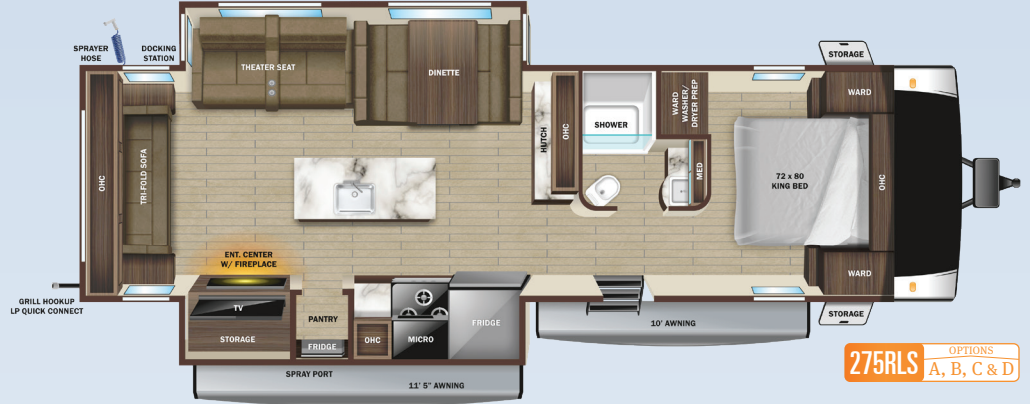
275RLS OPTIONS A, B, C & D