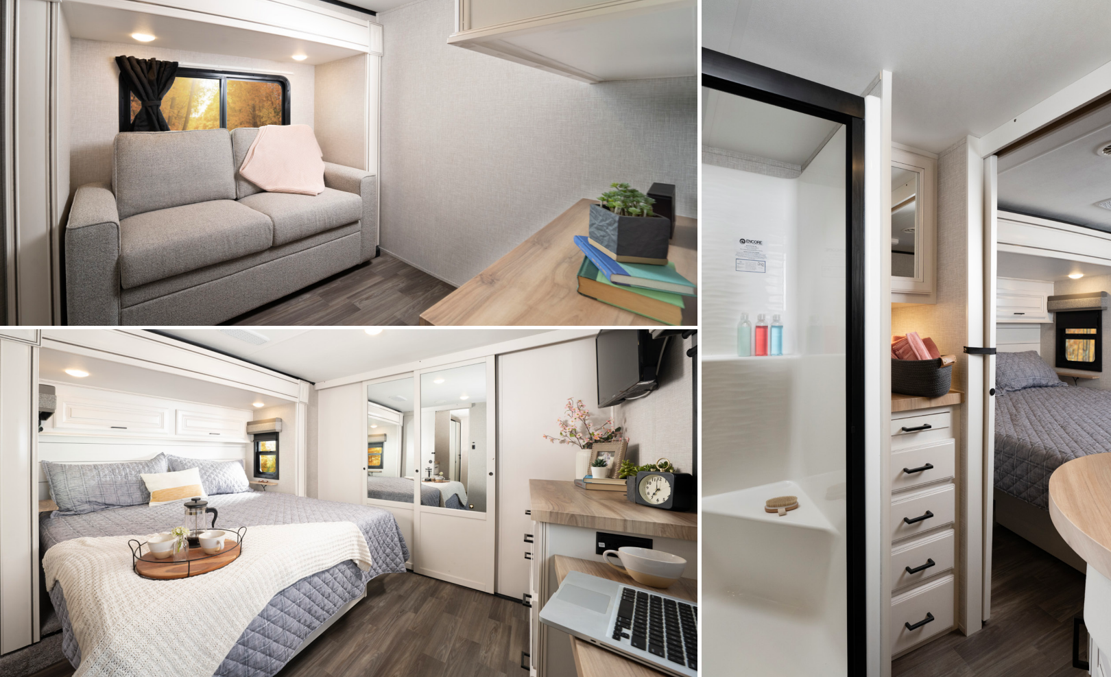
2024 Open Range 371MBH