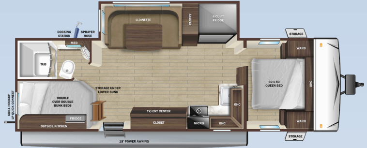
241BH OPTIONS B & C