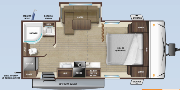
212FB OPTION A