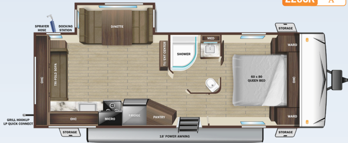
242RL OPTIONS A, B & C