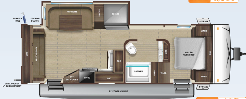
262RL OPTIONS A, B & C