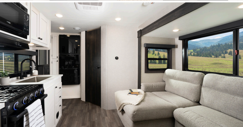
2022 Range Lite 252RB