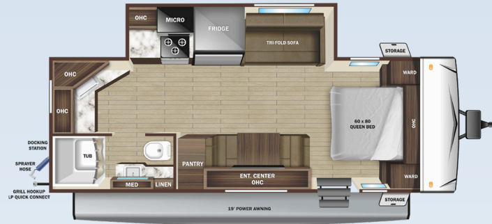
225CK OPTION A