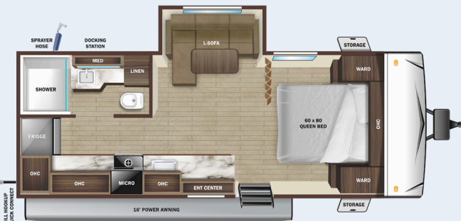
189RG A OPTION