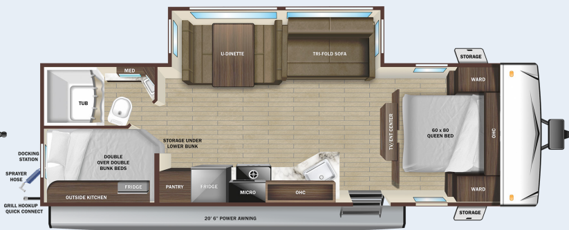
261BH A, B & C OPTIONS