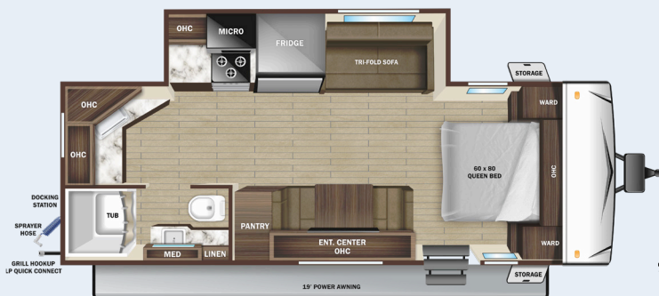
225CK A OPTIONS