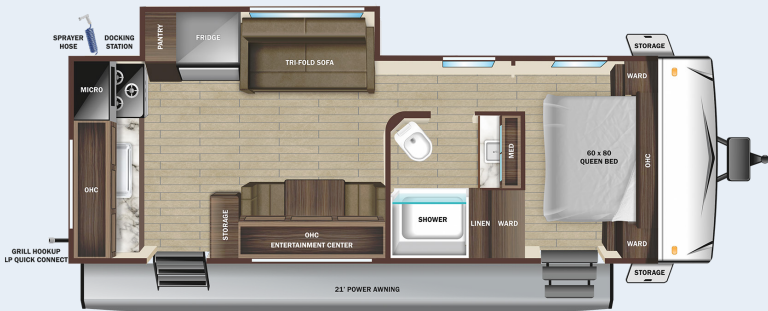
233ML A, B & C OPTIONS