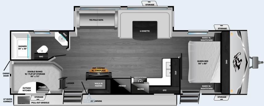
270DBL OPTIONS B, C, D & E