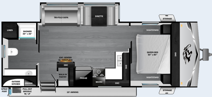
250RBL OPTIONS B, C, D & E