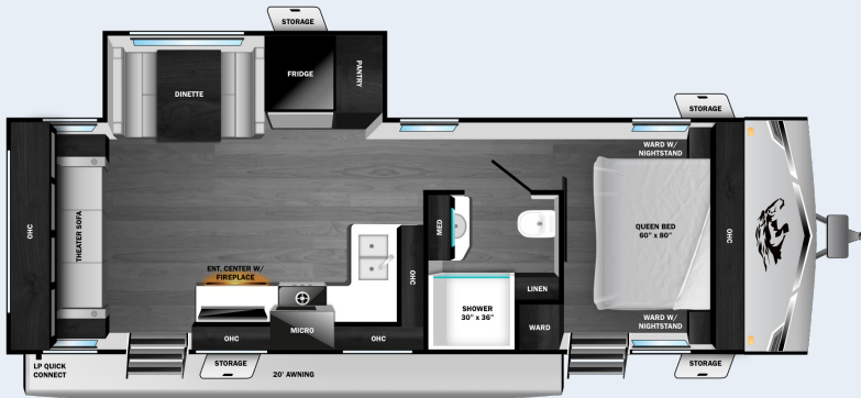
260RLL OPTIONS C & D