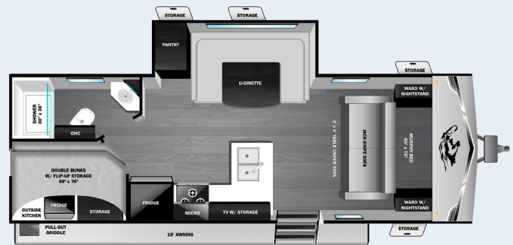
220DBM OPTIONS A, B & C