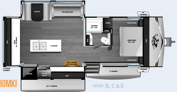
280MKI OPTIONS B, C & E