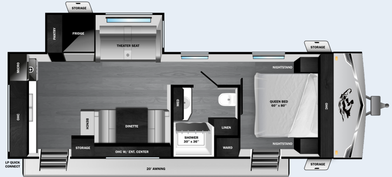
230MKD OPTIONS A, C & D