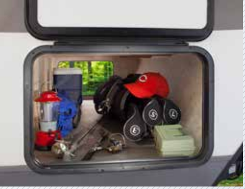
Exclusive "No Reveal" Baggage Door