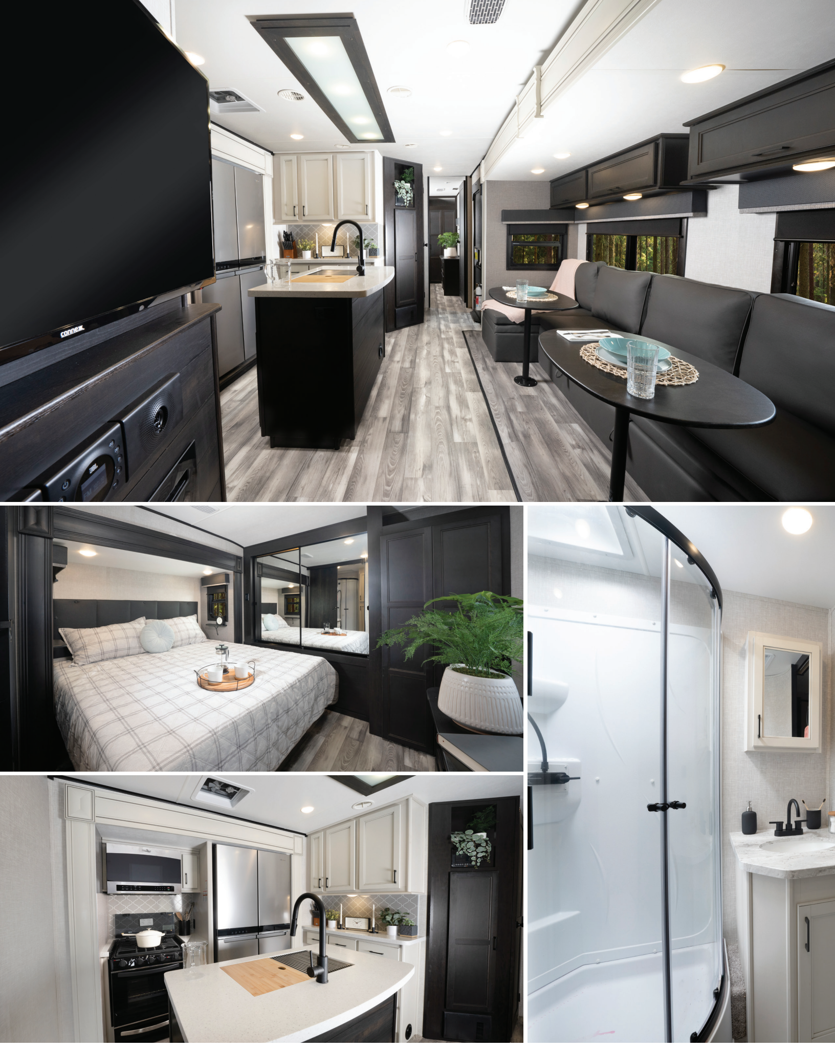
2023 Open Range Travel Trailer 338BHS