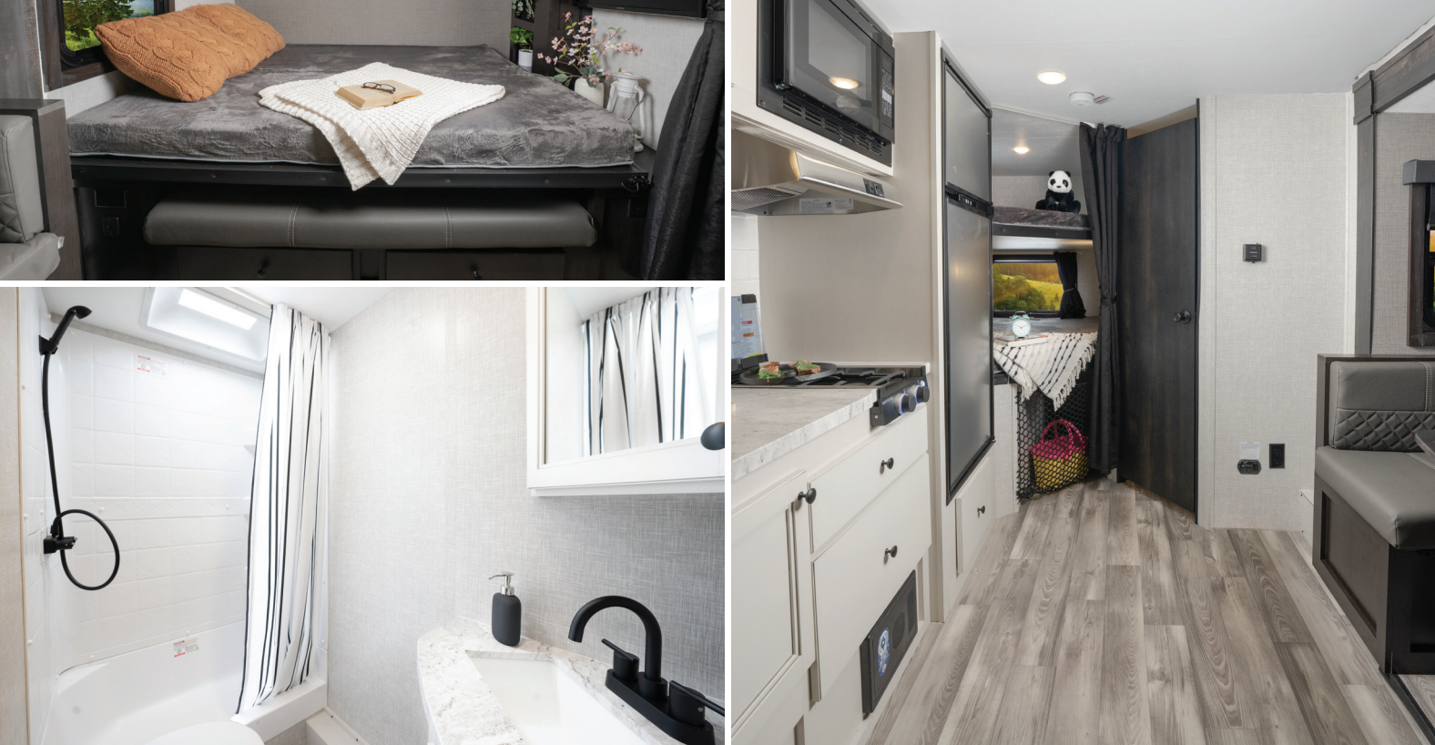
2023 Range Lite Air 19MBH